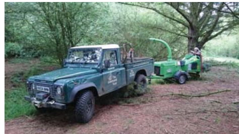
Tidying up the pine trees north bank of the Tiddenfoot lake

On May 19th, a small group of "Friends" spent a busy morning removing the lower branches of the pines adjacent to the path at the northern end of the lake, at the request of Central Bedfordshire Council. The timber was all chipped, with the exception of a few large logs. The photographs show the working party in action.