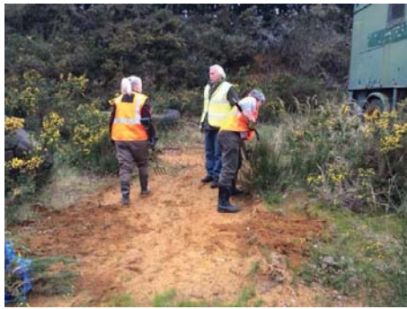
Digging up gorse and broom at Heath Quarry.