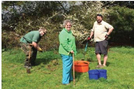
Transplanting gorse at Tiddenfoot