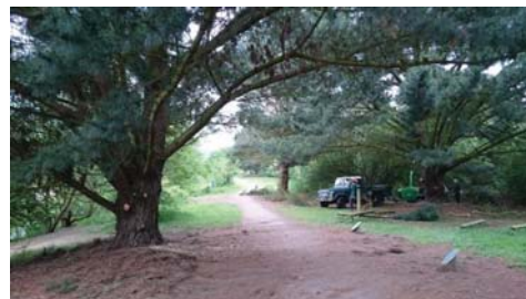
The tidied area around the pine trees