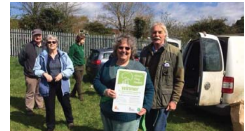
The Green Flag Community Award

scrub growing by the hedge bordering the ancient Foragers' Way, while also repairing the oldest sections of the hedge with new posts and binders. Meanwhile, to the south of Tiddenfoot Lake, there was a need to repair the vandal-damaged baskets recently constructed to protect the pollarded hazels from being eaten by deer. North of the lake the low-lying acid grassland needed protecting by stakes and tapes and the newly replanted gorse required nurturing. During this time litter was also being collected from the whole area of the Waterside Park; the Greensand Ranger carried out an inspection patrol and provided tea, with treats being provided by Tesco, thanks to Tom Wise. Many tasks were completed on that single day and, as Dave Ayers said: 'Between us, we are making a difference. Tiddenfoot Waterside Park is a better place through our endeavours.'