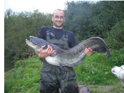
A denizen of the deep – a catfish

In this new feature of our Newsletter we look at the sheer scope of wildlife in Tiddenfoot Waterside Park.