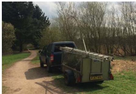
Transplanting gorse and broom at Tiddenfoot