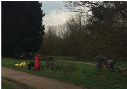
Transplanting gorse at Tiddenfoot